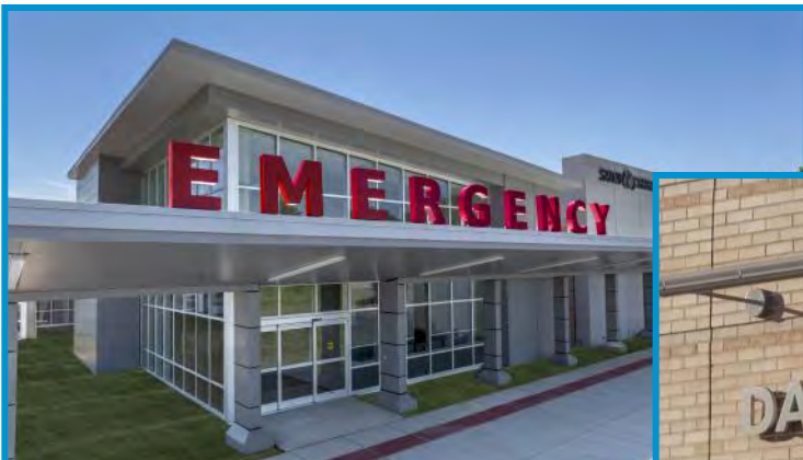
Daisy and John L. Oliver Plymouth Medical Center Emergency Room located at the Plymouth campus of the Saint Joseph Health System.

In his honor, the community rooms at the Marshall County Philanthropy Center are now named the John J. Oliver Community Rooms. These rooms are designed to connect and nurture community leaders and those vital collaborations that will move our communities into the future.